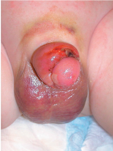
Hypospadias repair 6 days after surgery. Note swelling and bruising of penis and scrotum

doctor or myself. "Painstop Daytime" or paracetamol with codeine should be given regularly for the first 24 to 48 hours after the operation. After that time, assess your child's pain to see if paracetamol only ("Panadol") is all that is required. Follow the manufacturer's dose instruction but never give more than 4 doses in a 24-hour period. Be-