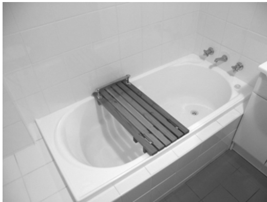
Wooden bathboard (For purchase only)

If you have loaned your bathboard, it is due to be returned by _____